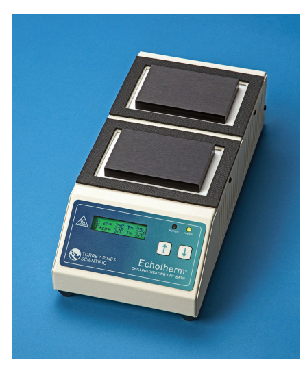
Model IC22 (right) Model IC22 with attachments (left)